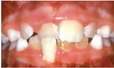
CROSSBITE OF FRONT TEETH

Malocclusions (“bad bites”) like those illustrated below, may benefit from early diagnosis and referral to an orthodontic specialist for a full evaluation.