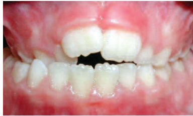
CROSSBITE OF BACK TEETH

Top teeth are to the inside of bottom teeth